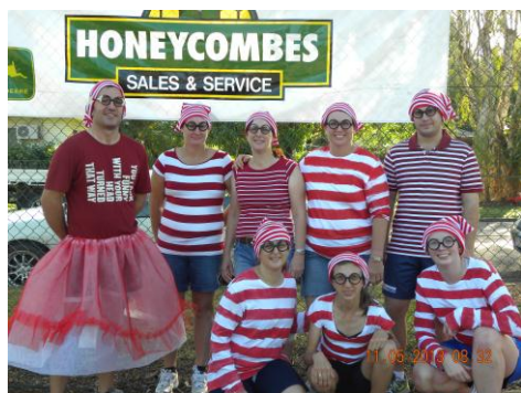
The much anticipated media release of the 'Where's Wally' cricket team photo.

If you know any families in our local area who have children under 8, make sure you let them know and encourage them to attend. We will finish the morning with a sausage sizzle